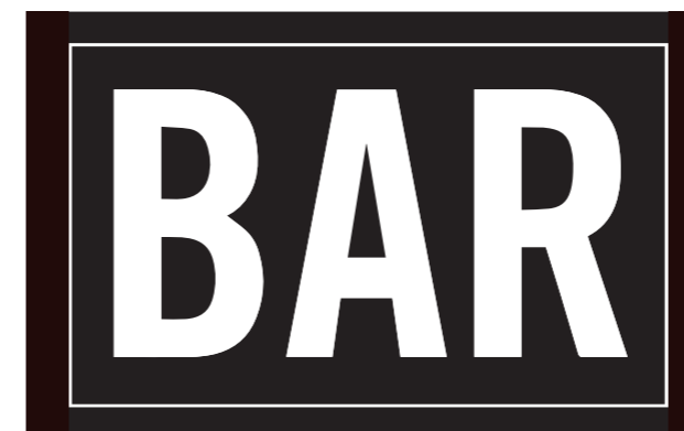
BRICK OVEN PIZZA, HOUSE BREWED BEER, DANCING